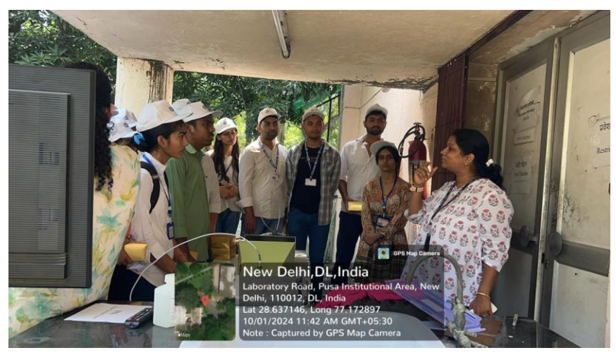
Students visit to CSIR "National Physical Laboratory"