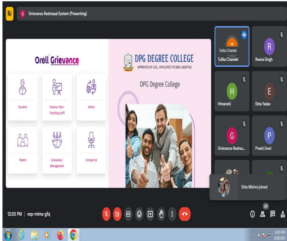
Screenshots of Online meeting by edugrievance and DPG Degree College